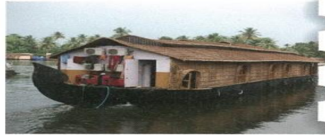
▲ boat house

wooden boats to live on the water. The boats have rooms for their families. Some boats have a living room and a kitchen. The fishermen can fish and live at the same time.